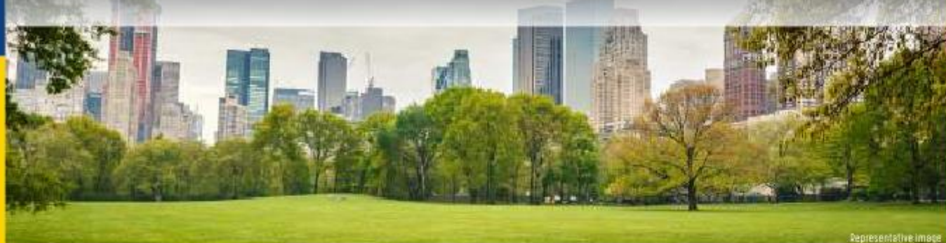
Large open spaces for better community living