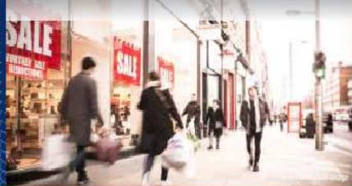
Lifestyle brands and convenience retail in the premises