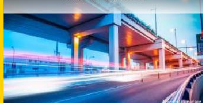
Direct access to Eastern Express Highway enabling shorter travel time.