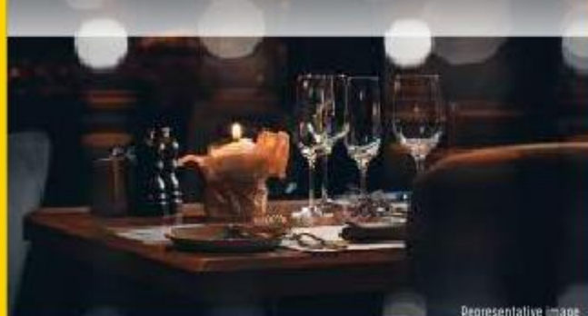
City's popular restaurants and cafes in the premises