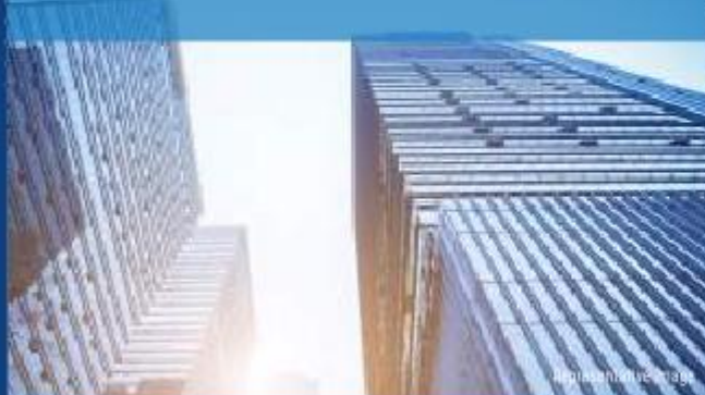
Premium commercial tower in the development