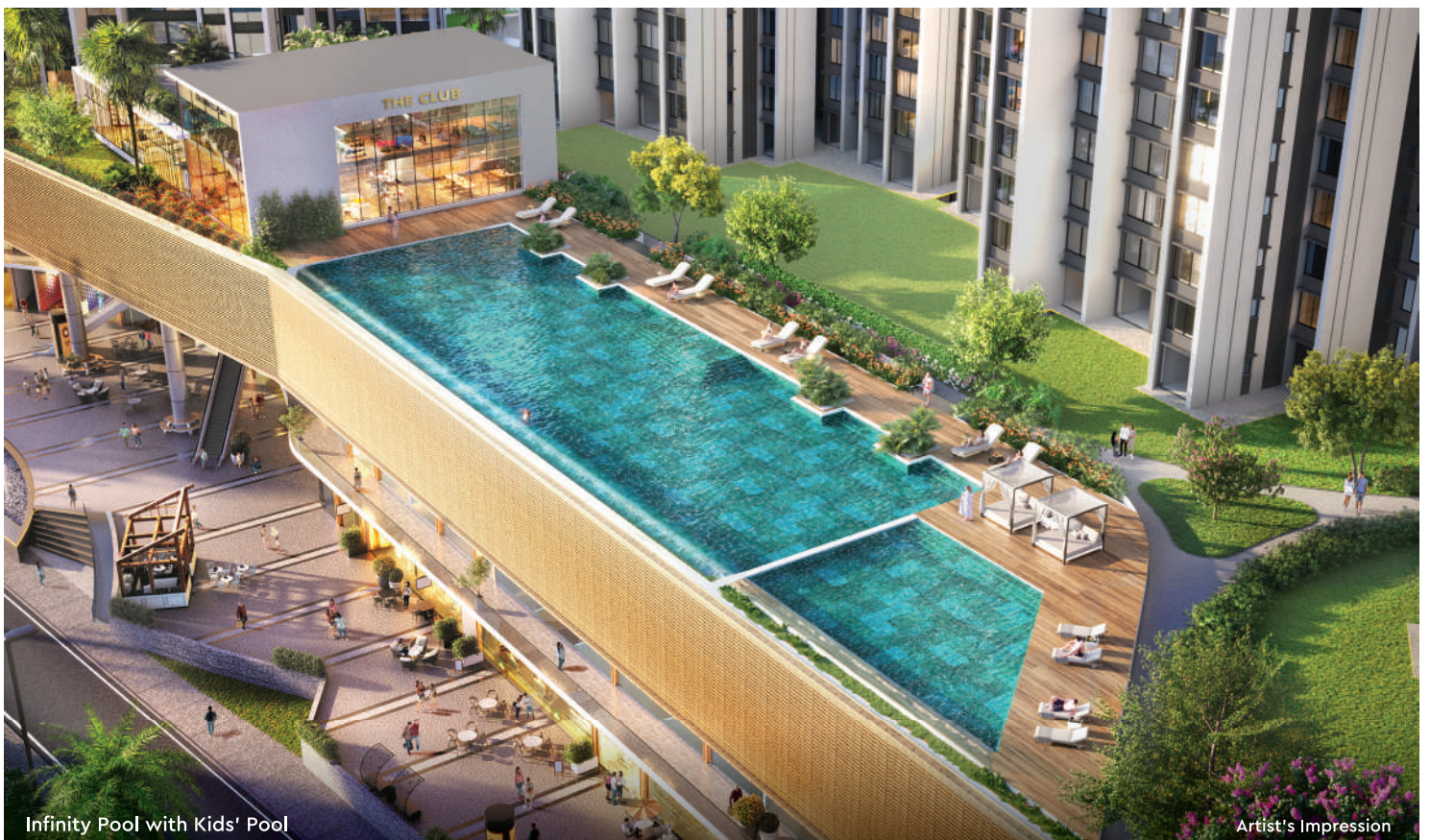
Infinity Pool with Kids' Pool