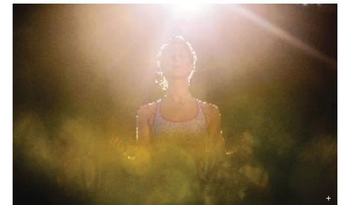
+ Stock Images used for representation purpose only