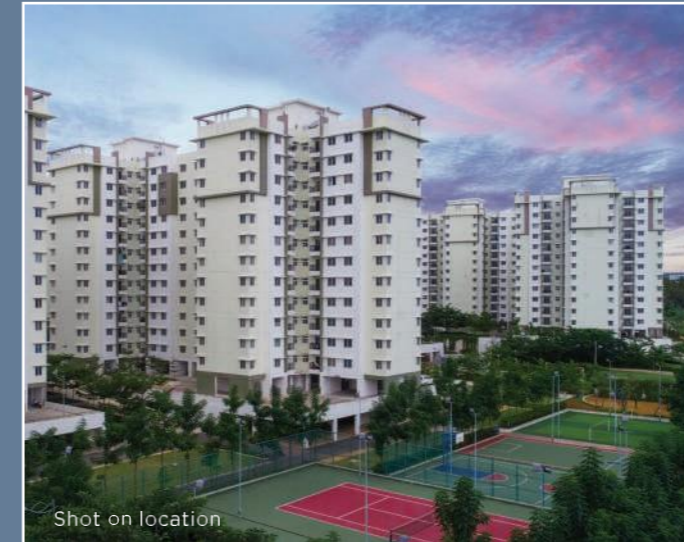
Shot on location