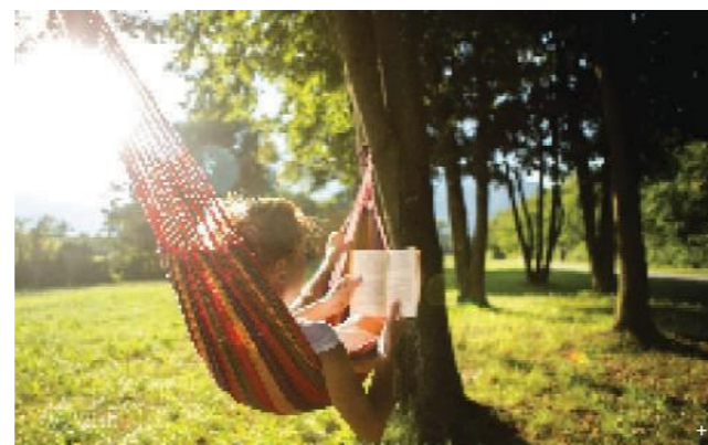
Stock Images used for representation purpose only