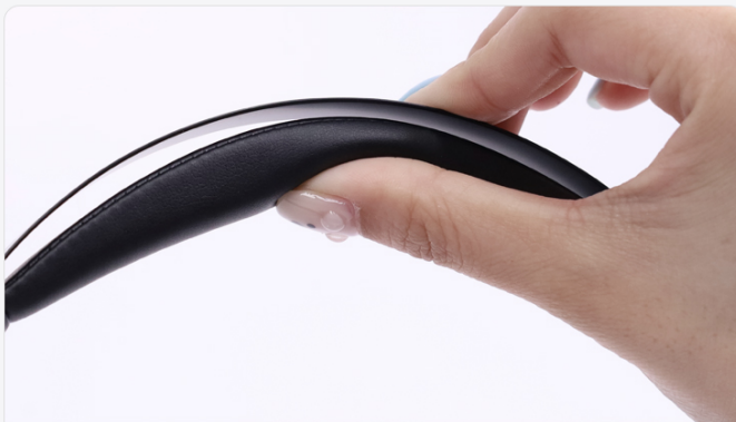
Soft padded leather sling