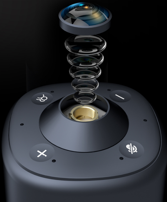
360° Fisheye Lens with Sony sensor