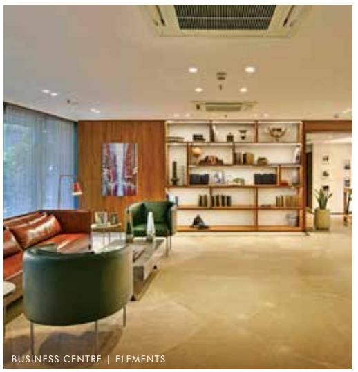
SHOT AT A RUSTOMJEE PROPERTY