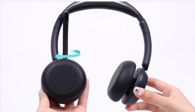
180° rotatable ear muffs

Minimize pressure on ears and head, catering to various head sizes