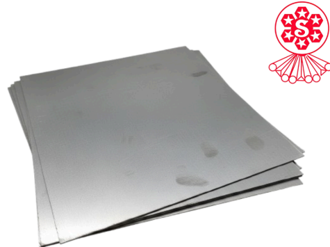
SS 202 2B Sheet Manufacturers in India -Sarvottam Steel